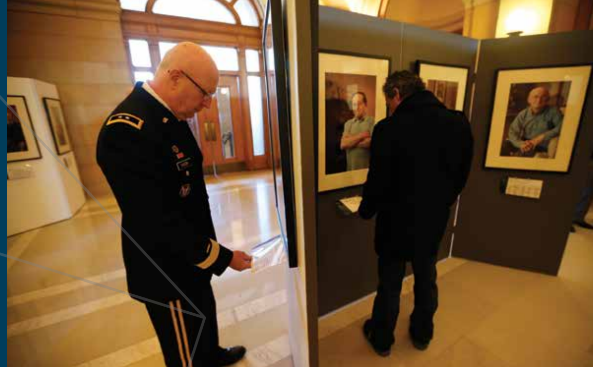
Minnesota’s observance of International Holocaust Remembrance Day, January 2013

JCRC strives to fulfill its mission by teaching about the Holocaust and its consequences in a way that is relevant to the community, while also educating about survivors who settled in Minnesota.